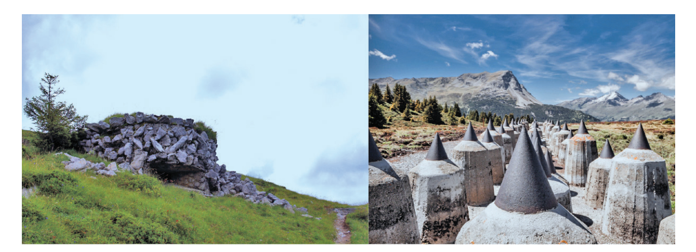
Figure 2. A bunker with camouflage above the Žiri Basin – tangible heritage (figure 2a – left; source: author's own archives). The interplay of natural and man-made elements in the landscape – intangible heritage (figure 2b – right; source: Roberto Ferrari)

Given the exploration of the significance of spatial landmarks, cartography was used as a method of studying the physical form of quantifiable and legible content. This also involves the studying of historical maps and other archival documents. These revealed the unique perspectives on landscape interpretation prioritizing the military exigences yet the same logics can be put to other purposes in landscape interpretation today.